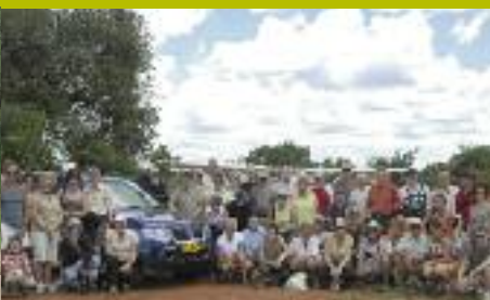
Suzuki Dealers trip from Holland.