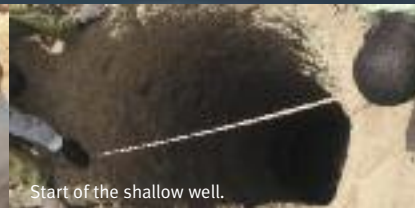
Start of the shallow well.