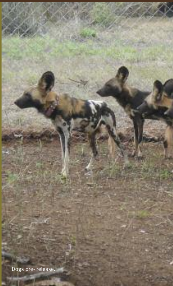
Dogs pre- release.

Meanwhile, two groups of wild dogs circled our camp for a few months and then moved on. They can be enigmatic in the bush and it is interesting to see over the years the amount of wild and hidden roaming packs that have come near the breeding compounds through unknown routes and origins.