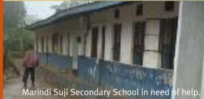
Marindi Suji Secondary School in need of help.

GAWeV has also raised the funds for the construction of the Hedaru Secondary School library (cement bricks, walling cement and roofing sheets).