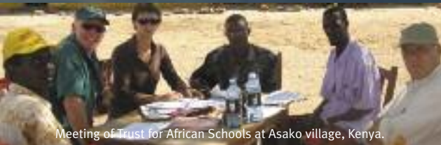
Meeting of Trust for African Schools at Asako village, Kenya.