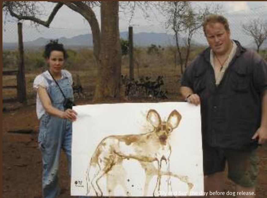
Olly and Suzi the day before dog release.

The keepers - Sangito, Ayubu and Ombeni - maintain the extensive daily routines and attentive care of the dogs.