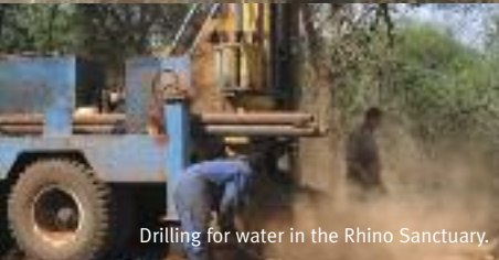
Drilling for water in the Rhino Sanctuary.