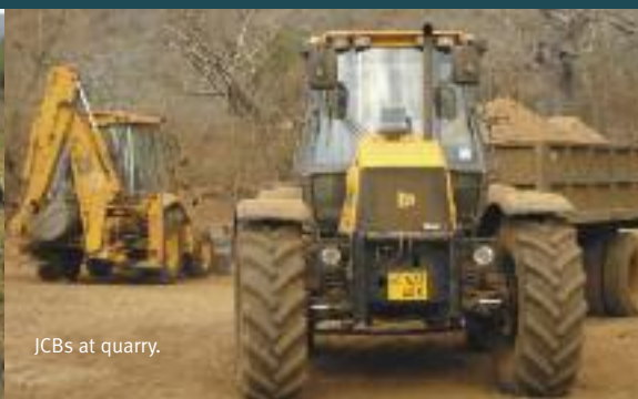
JCBs at quarry.