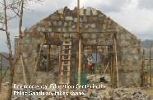
Environmental Education Center in the Rhino Sanctuary takes shape.