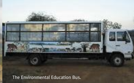
The Environmental Education Bus.