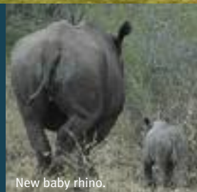
New baby rhino.