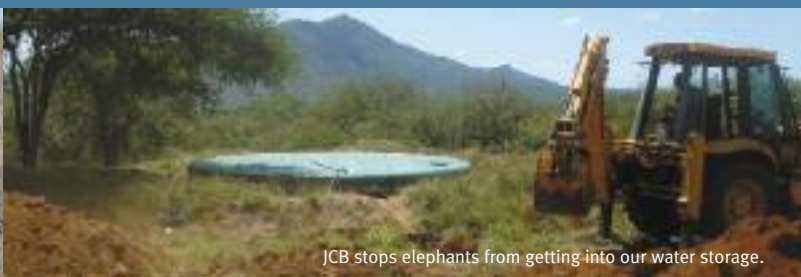
JCB stops elephants from getting into our water storage.