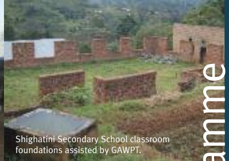
Shighatini Secondary School classroom foundations assisted by GAWPT.