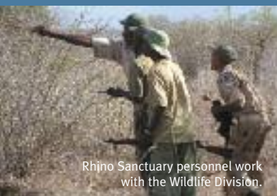
Rhino Sanctuary personnel work with the Wildlife Division.