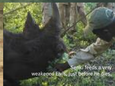
Semu feeds a very weakened Elvis, just before he dies.