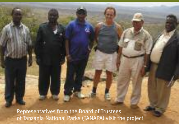
Representatives from the Board of Trustees of Tanzania National Parks (TANAPA) visit the project